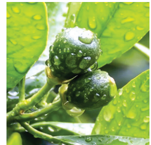
Pre fruit drop